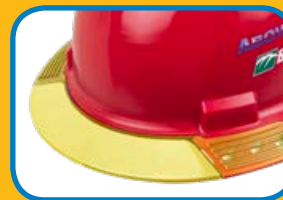
Yellow Tint to prevent glare