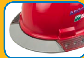
Grey Tint for shade